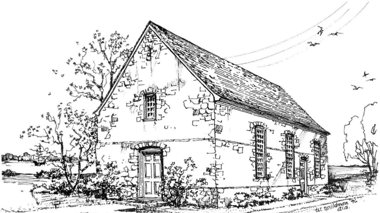
the 1697 york parish church now conjectural sketch of GRACE EPISCOPAL CHURCH - at yorktown, va.

GRACE EPISCOPAL CHURCH YORKTOWN, VIRGINIA Walking in love. Welcoming all.